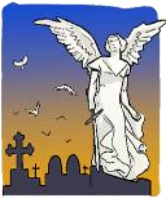
All Souls' Day