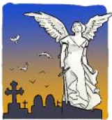
All Souls' Day

Please bring your All Souls envelopes with remembrances for the altar. We will leave them on the altar for the month of November to be mentioned at all Masses. Envelopes are available in the gathering space if you did not receive one in the mail.