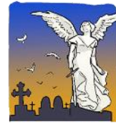
All Souls' Day

We will celebrate All Souls Day with Masses at 9:00 am, 12:10 & 4:00 pm. Please bring your All Souls envelopes with remembrances for the altar. We will leave them on the altar for the month of November to be mentioned at all Masses. Envelopes are available in the gathering space if you did not receive one in the mail.