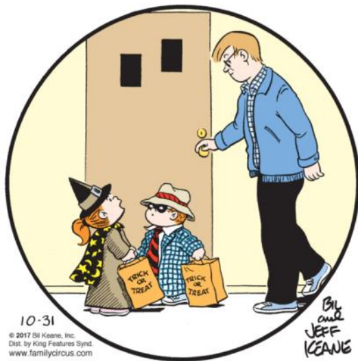
"Instead of saying 'Trick or Treat,' aren't there any Halloween carols we can sing?" Bill and JEFF KEANE

Almighty Lord God, give us true faith, and make that faith grow in us day by day. Also give us hope and love, so that we may serve our neighbors according to Your will; through Your Son, Jesus Christ our Lord, who lives and reigns with You and the Holy Spirit, one God, now and forever. Amen.